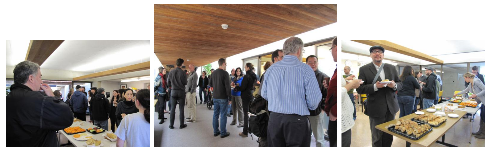
Mingling and socializing over lunch!