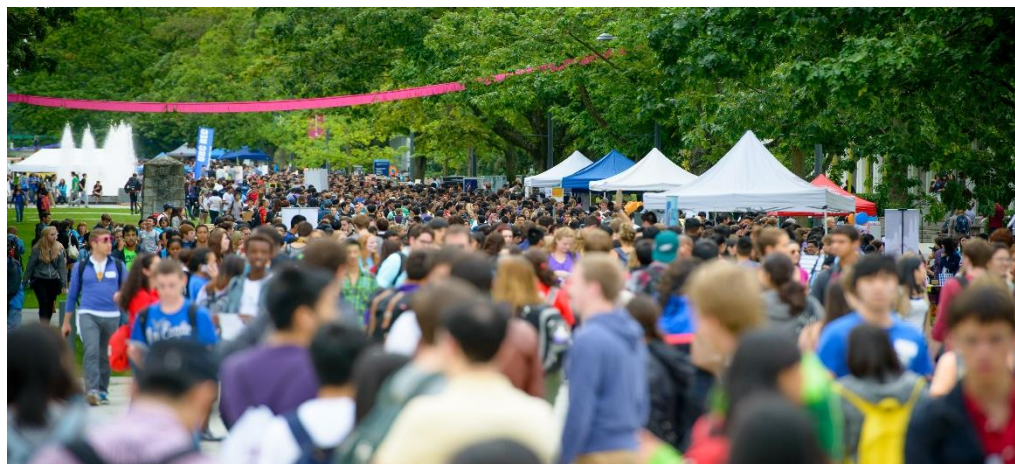
Students Gathering on Imagine UBC Day