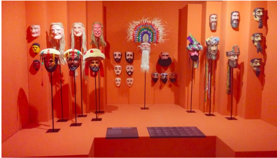
Theatres of Memory installation (right)