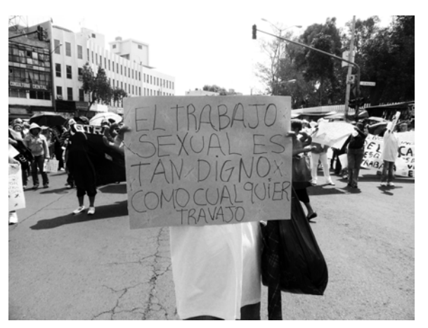
"Sex Work Is as Worthy as Any Other Job", Labour Day March Placard, May 2011